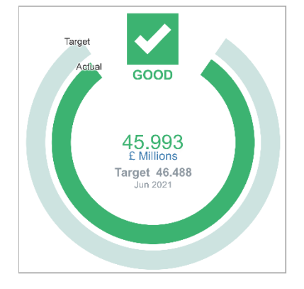
Forecast outturn against target budget